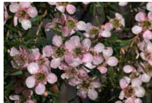
Leptospermum Pink Cascade