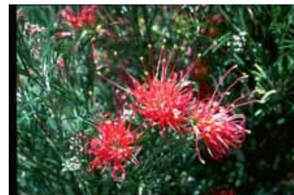
Grevillea Winpara Gem