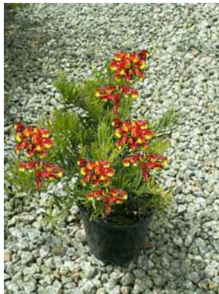
Grevillea Bonnie Prince Charlie