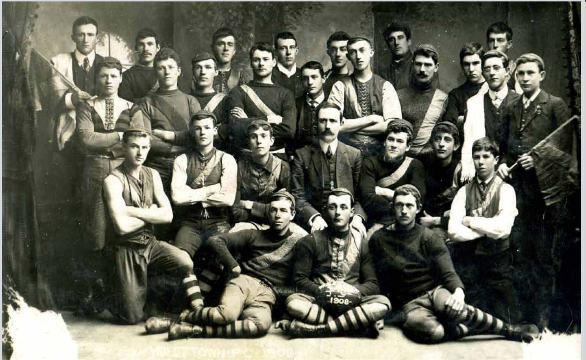
The Violet Town Football team of 1908 played irregularly, travelling to neighbouring towns in horse-drawn vehicles. In the early 1900s they struggled to field a team. Because of the East-West orientation of the Violet Town field and the position of goal posts the afternoon sun blinded players and a tree too close to the goal posts made play difficult. Ramage collection