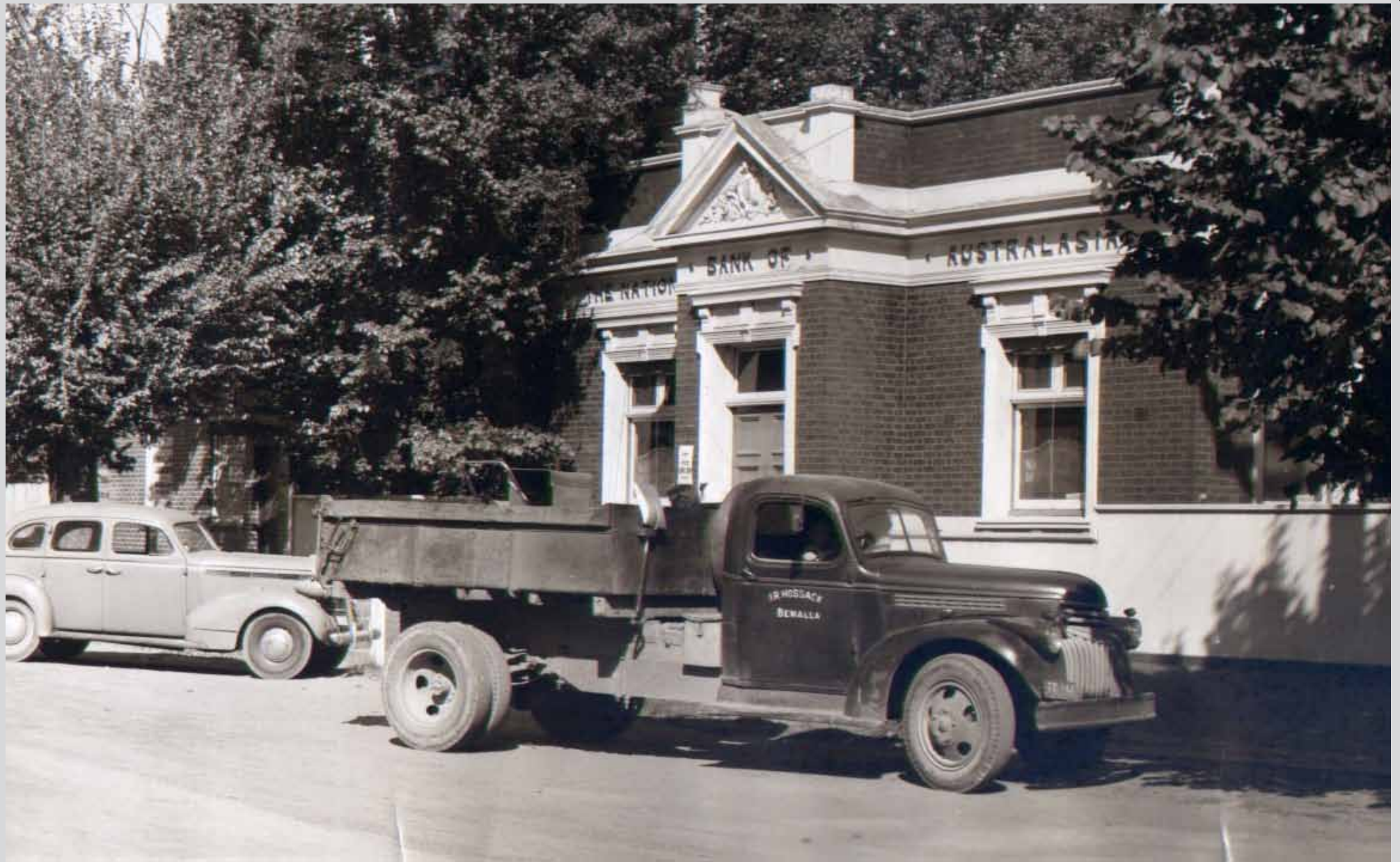
The National Bank of Australasia building, later to become the 'Wine Exchange', is seen here in 1949 when the 'Back to Violet Town' celebrations were held. Vehicles of the period stand at the kerb.