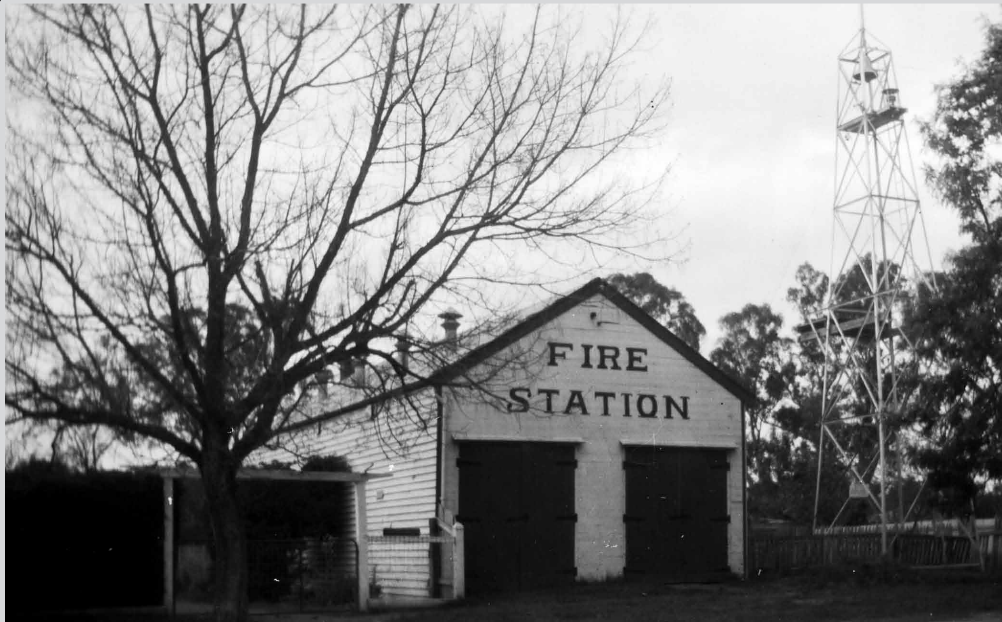
Violet Town has long had a fire fighting team, housed initially in a building at the east end of Cowslip on the now vacant land opposite the Post Office, but in recent years in its present location. The Farmer's Arms Hotel, although not visible, was to the right of the image. Date unknown