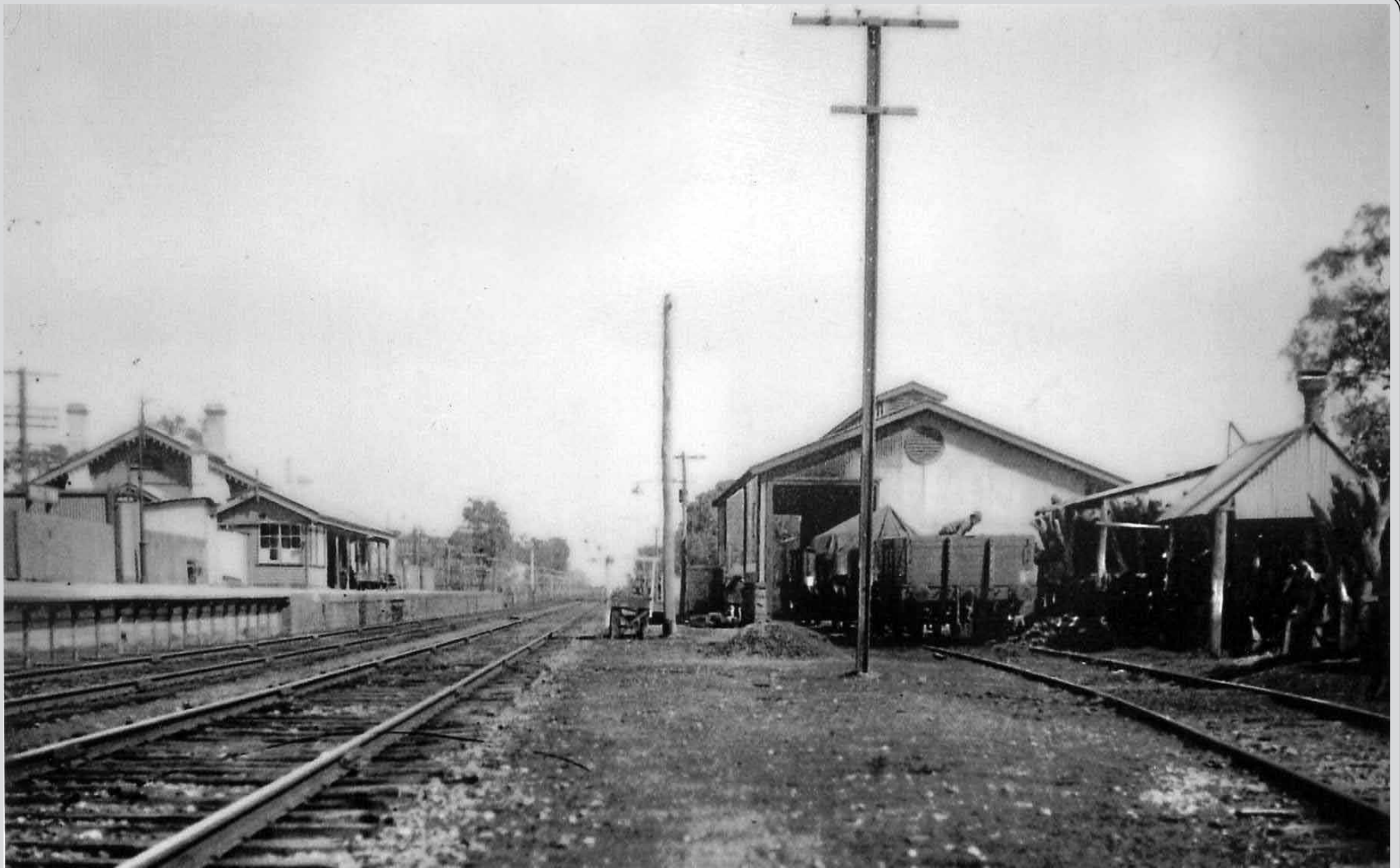
One of the few images we have of the railway station when the goods shed was operating, as evident here. The station building was later removed and replaced with the current building, in a different position. Note the chimney of the steam engine driven saw mill poking through the roof of the small shed. The goods shed was demolished in May 1987 and rebuilt as a shearing shed on a property near Baddaginnie. c1925