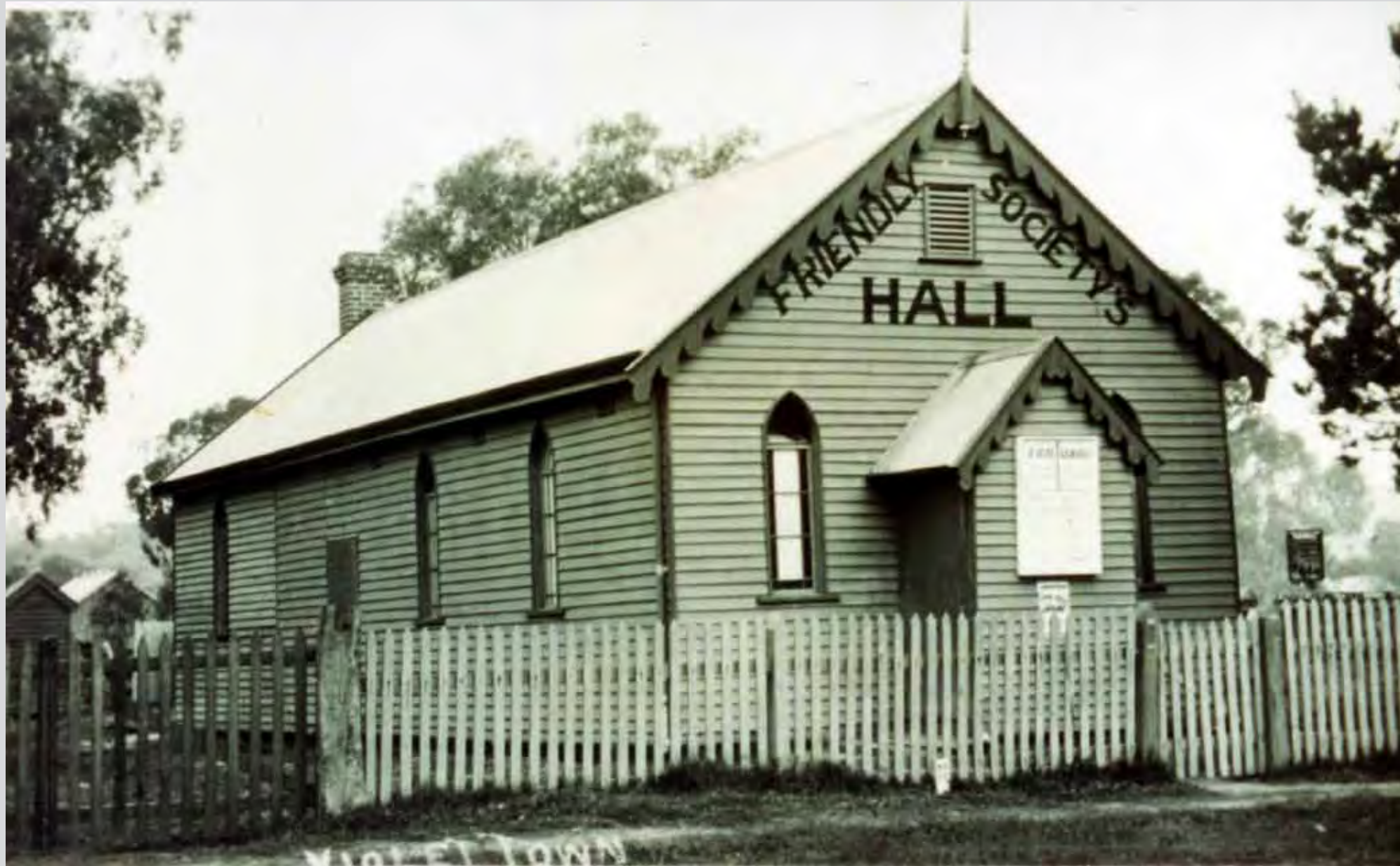
The Friendly Society's hall was located in Primrose St, opposite the railway station, alongside St Attractus Church and used by many organisations in the community including the Austral Girls Club, the Methodist Church, the Australian Women's League to name a few and was even used as a court house. It was however demolished in the 1960s.