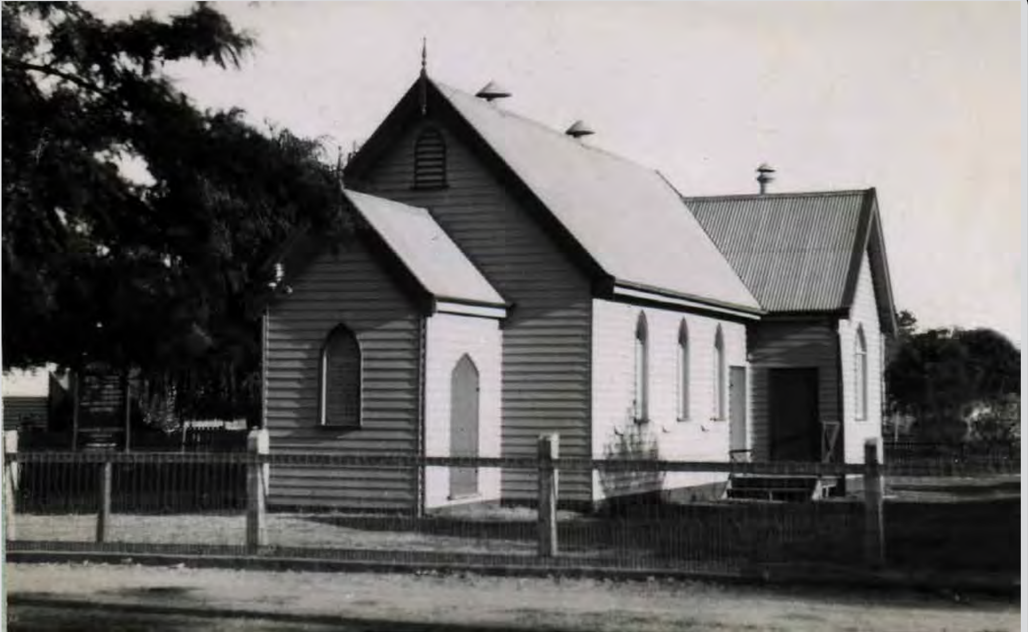
The Methodist Church, originally in Cowslip St opposite what is now 'Strathbogie Floats', was built in March 1908 and removed in the late 1970s to Earlston at the formation of the Uniting Church (June 1977). A parsonage was located alongside the church and two tennis courts behind the church. An original toilet bowl is still in place.